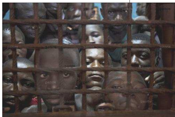
Picture made inside Pademba Prison

the imprisonment of children together with adults," the religious said. According to internal calculations 300 children are currently among the 1,756 prisoners. The prison was built for 350 people. Fambul offers both pastoral and social projects at the prison.