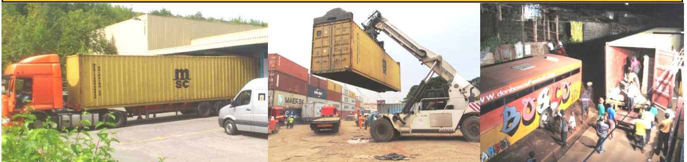
Stations of an aid container on its way from Germany to Sierra Leone: when loading the goods in Trierweiler-Sirzenich (left), in Freetown's port (middle) and when unloading in front of Don Bosco Fambul (right).