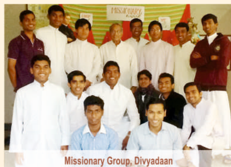
Missionary Group, Divyadaan