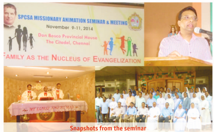
Snapshots from the seminar