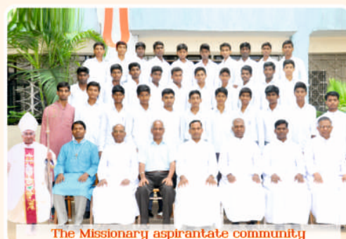
The Missionary aspirantate community