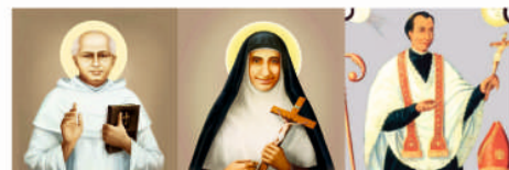
This issue is dedicated to St. Kuriakose Elias Chavara, St. Euphrasia of Sacred Heart of Jesus and St. Joseph Vaz, the newly canonized saints in the region.