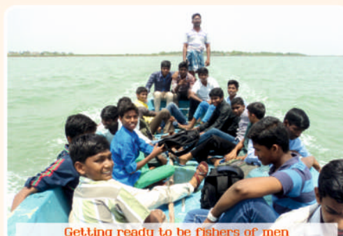
Getting ready to be fishers of men