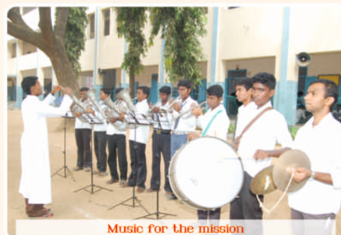
Music for the mission