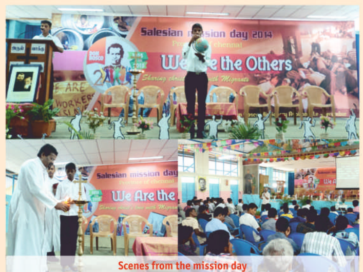
Scenes from the mission day

The reflections of the day were converted into fervent prayer as we placed before Christ the King, the migrants all over the world and Salesian efforts at bettering their plight. The participants left the venue with the resolve to get to know more about the migrant situation and do something in order to lighten their grim situation. May the Salesian missionary heart impel us!