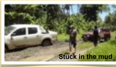
Stuck in the mud