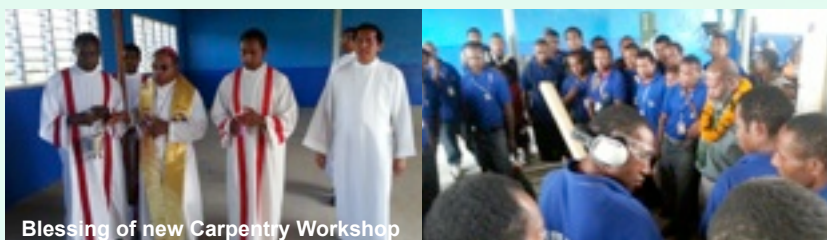
Blessing of new Carpentry Workshop