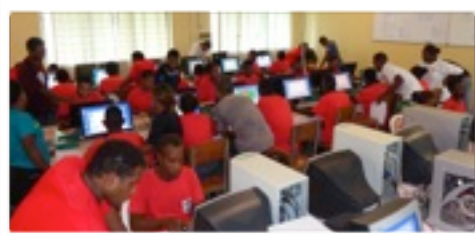
In the Computer room

24 San Isidro Care Centre Students accompanied by their staff spent an enjoyable weekend at Don Bosco Technical Institute, Henderson. The programme was held on the 3 rd and 4 th May, 2013.