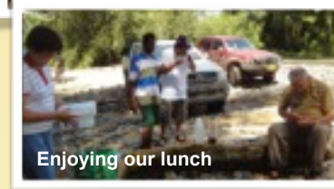
Enjoying our lunch

Not knowing the exact location of the place we felt that the trip was too long, but we were determined to reach our destination. We arrived at the parish house and then learned that we have to walk uphill on a difficult and slippery track. Fr. Valeriano climbed up quite quickly, while a few of us struggled to reach the top. We visited the graves and said our prayers and returned back. Due to the rain the rivers were filling up and one of our vehicles got stuck in the mud and had to be towed out. We all enjoyed the trip and found a dry river spot to have our lunch. We then finally continued our trip back to Kokopo.