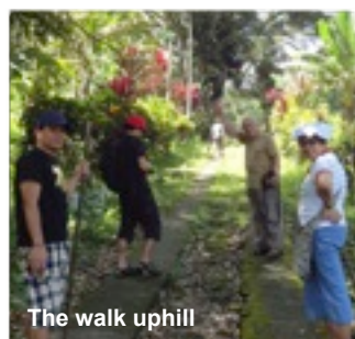
The walk uphill