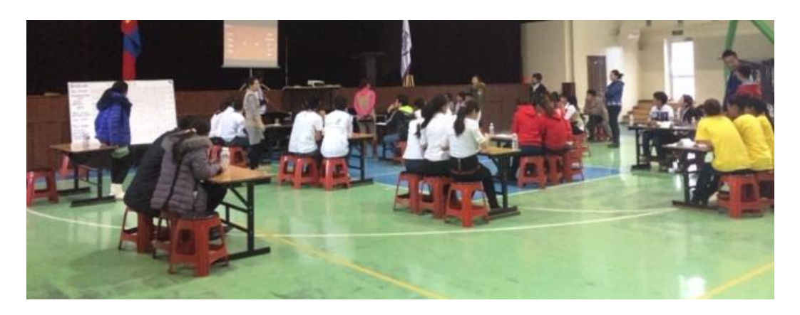
Competition on Mongolian culture and tradition for our students