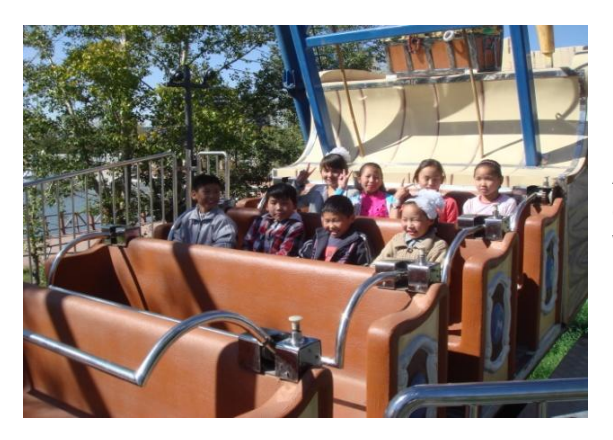
SPC Elementary school and kindergarten: All of us, elementary school and kindergarten children, went for a picnic in the children park. We had a fantastic time.