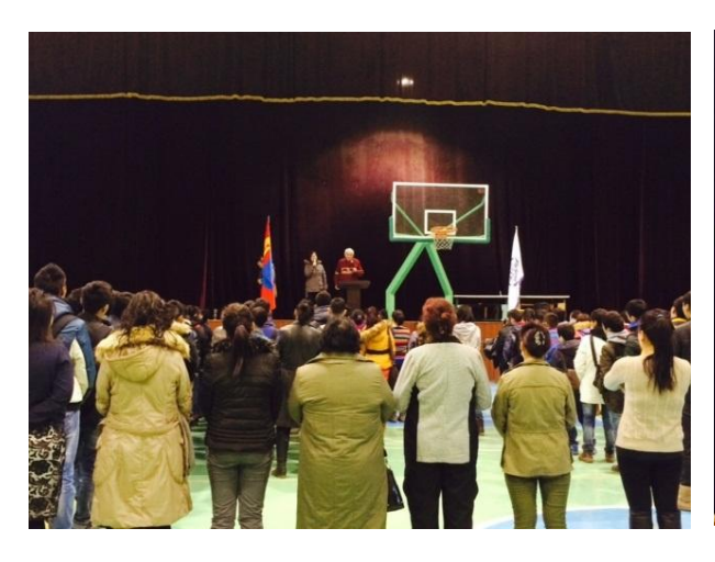
Every day traditional 'Good morningtalk' for our students and teachers