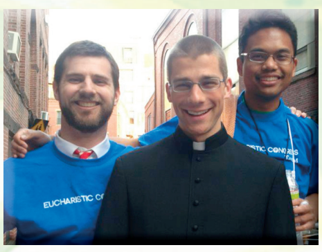
Helping out at the Eucharistic Congress in Boston with two friends

ing in material poverty with no way of advancing academically and there was absolutely nothing I could about it in one short month. But I prayed about it every night and I realized that his most basic need is the same as the wealthy and talented students on my college campus back in the States – they need God, they need God's love. Love is the