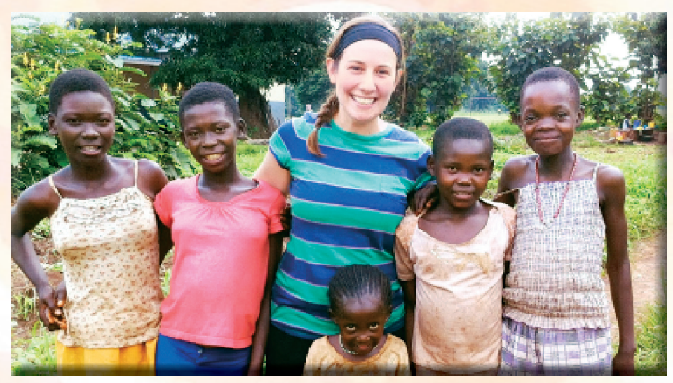
SLM Grace with a few of her loving and affectionate "students."

It's been a wild ride and a challenging, exciting adventure. With three remaining months, I'm hoping and praying to take in and appreciate every last second with those sweet children and loving adults who have unknowingly taught me how to view the world through different eyes.