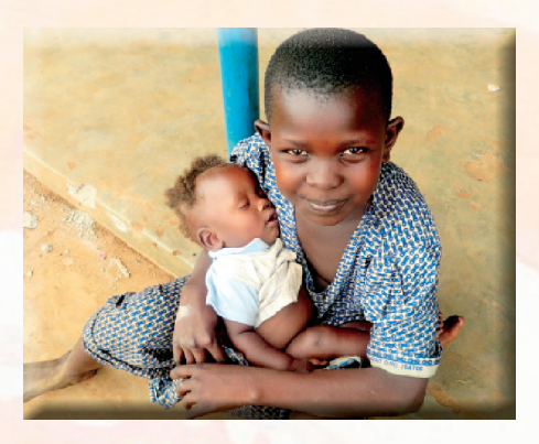
The face of this child holding his baby brother illustrates the simple joy these children find in a life that offers them very little.

Simplicity . We need so much less to survive happily and peacefully than we can even fathom in our comfortable homes in America. I've barely missed the restaurant chains, strip malls, or