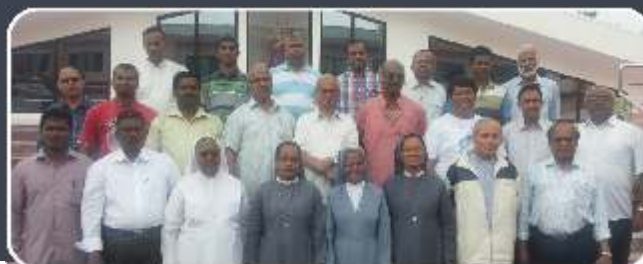
Participants of the missionary course

The second Inter-regional missionary course was held at Sacred Heart College, Shillong, from August 03-30. There were 22 participants, including one each from Myanmar and the Philippines.