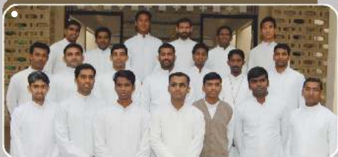
The missionary group of Kristu Jyoti College, Bangalore