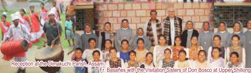
Reception at the Dimakuchi Parish, Assam