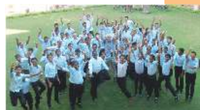
A moment of Salesianity with the missionary aspirants at Sirajuli