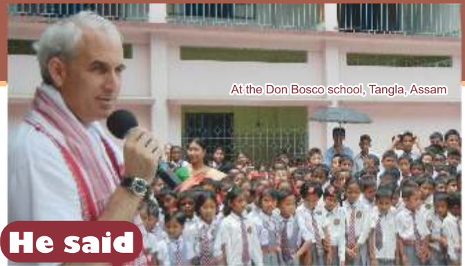
At the Don Bosco school, Tangla, Assam