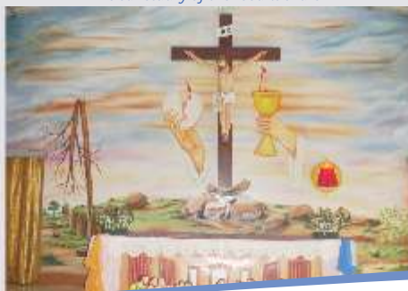
The sanctuary of the rebuilt church