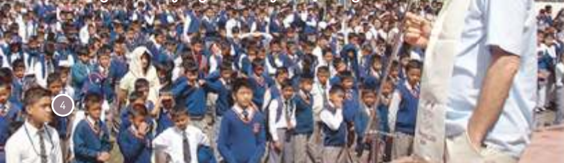
At the MSMHC Novitiate at Mawroh, Shillong