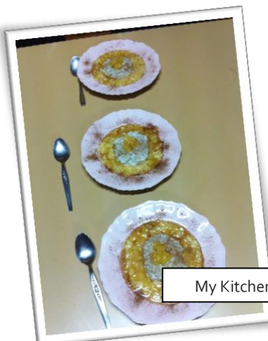
My Kitchen Rules desserts!