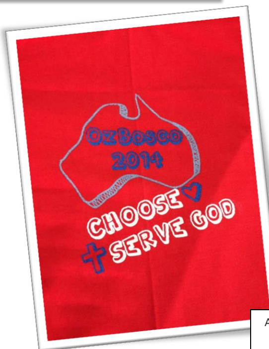
A student prepares the t-shirts for OzBosco 2014 and the finished product

Don Bosco Technical School in Phnom Penh runs a printing press that delivers fantastic screen printing at a really low price. All the profit goes directly back into the running of the school! We recently had our Oz-Bosco t-shirts printed there and they look fabulous. Please contact the Cagliero office if you are interested in ordering some t-shirts.