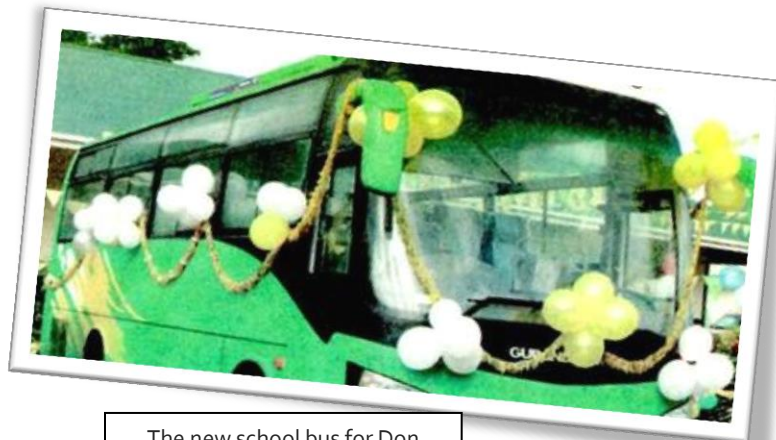
The new school bus for Don Bosco High School in Salelologa

Check out www.donboscosamoa.org for more details and photos on the bus.