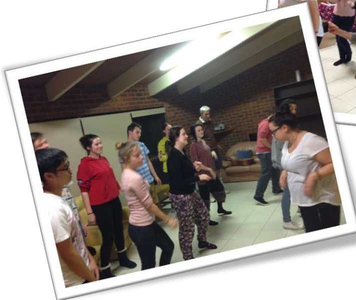
Dance practice for the Samoa Immersion participants