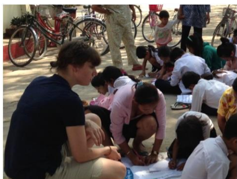
Bess working with beneficiaries from DBCF