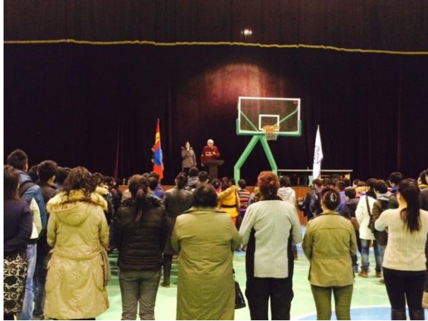
Every day traditional 'Good morning-talk' for our students and teachers