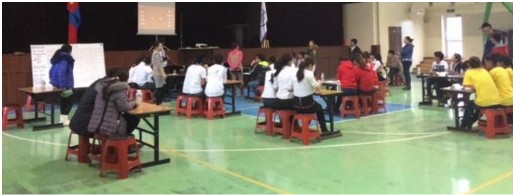
Competition on Mongolian culture and tradition for our students