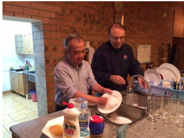
... they came, visited and served ...