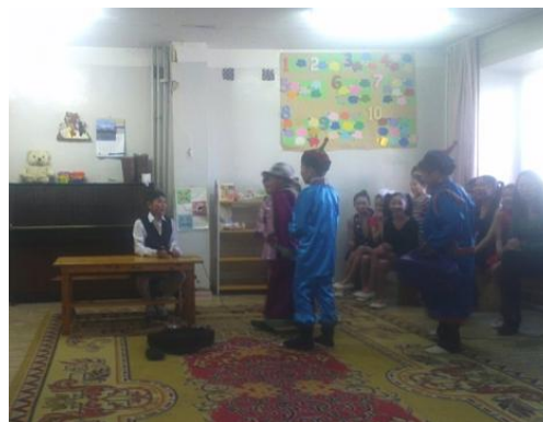
VCC children – theatric presentation