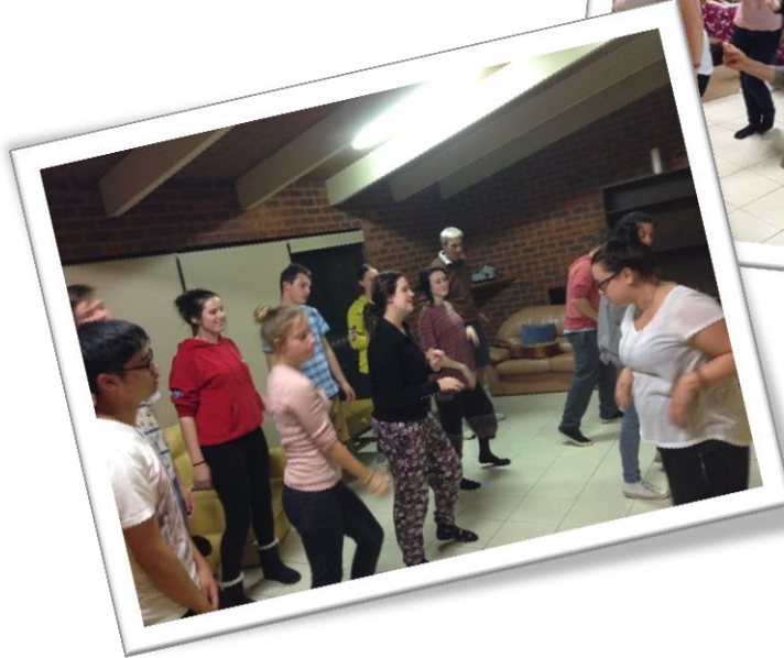
Dance practice for the Samoa Immersion participants