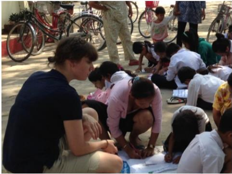
Bess working with beneficiaries from DBCF