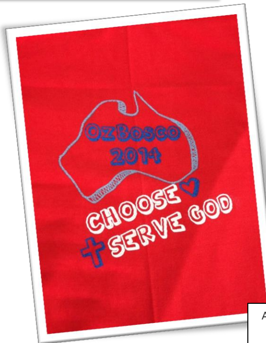
A student prepares the t-shirts for OzBosco 2014 and the finished product

Don Bosco Technical School in Phnom Penh runs a printing press that delivers fantastic screen printing at a really low price. All the profit goes directly back into the running of the school! We recently had our Oz-Bosco t-shirts printed there and they look fabulous. Please contact the Cagliero office if you are interested in ordering some t-shirts.