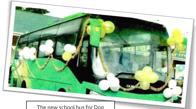
The new school bus for Don Bosco High School in Salelologa

Check out www.donboscosamoa.org for more details and photos on the bus.