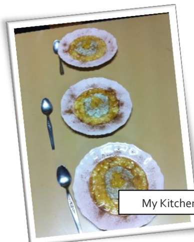
My Kitchen Rules desserts!