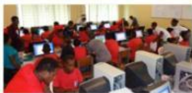
In the Computer room

24 San Isidro Care Centre Students accompanied by their staff spent an enjoyable weekend at Don Bosco Technical Institute, Henderson. The programme was held on the 3 rd and 4 th May, 2013.