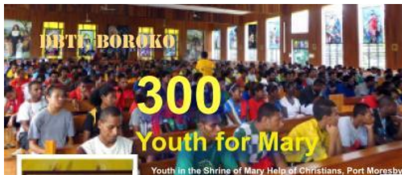
Youth in the Shrine of Mary Help of Christians, Port Moresby