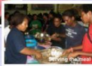
Serving the meal