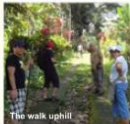
The walk uphill