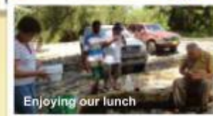
Enjoying our lunch

We visited the graves and said our prayers and returned back. Due to the rain the rivers were filling up and one of our vehicles got stuck in the mud and had to be towed out. We all enjoyed the trip and found a dry river spot to have our lunch. We then finally continued our trip back to Kokopo.