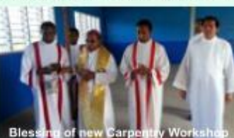
Blessing of new Carpentry Workshop