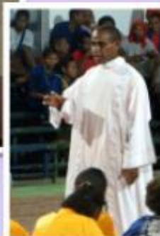
Session in progress