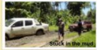
Stuck in the mud