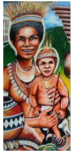
Mary Help of Christians Papua New Guinea