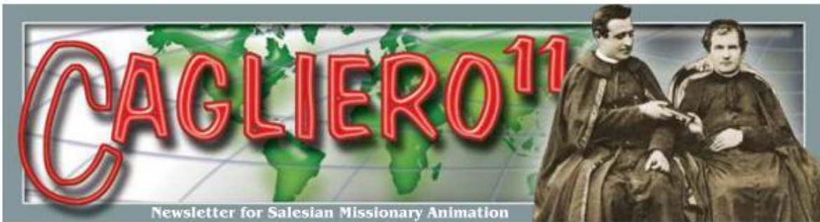
Newsletter for Salesian Missionary Animation A Publication of the Mission Department for the Salesian Communities and Friends of the Salesian Mission

Dear Salesians and friends of the Salesian mission,